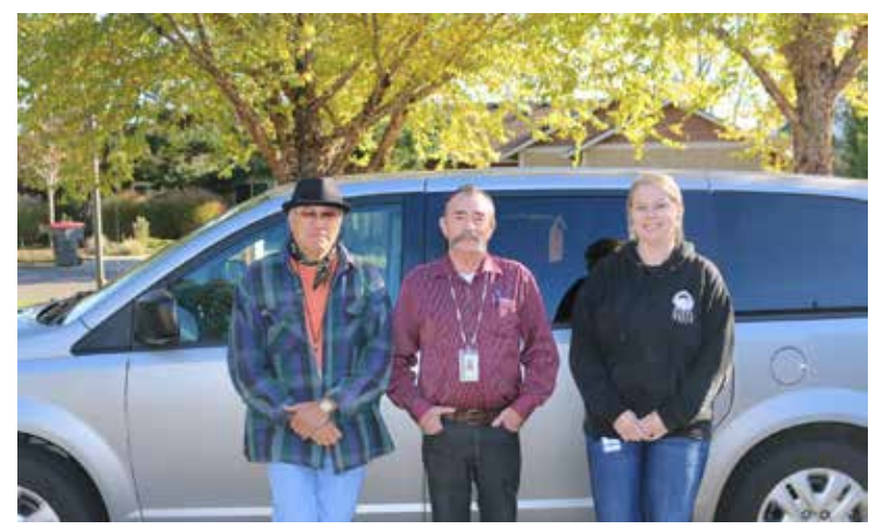
Thank You, Community Health Department

\label{lem:capacity} \textbf{Capacity is limited, please call at least five business days before your appointment.}