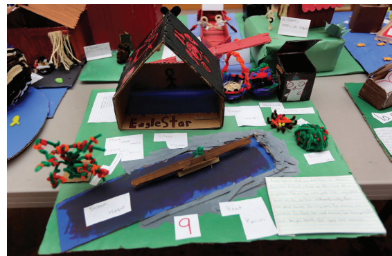
Projects made by 8th grade students at Faulconer-Chapman School using CTGR curriculum