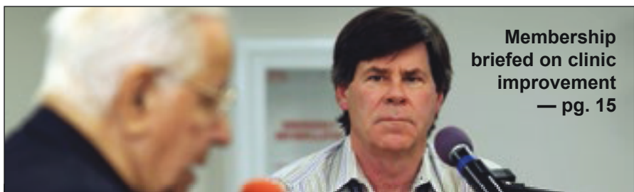
Membership briefed on clinic improvement — pg. 15

PRESORTED STANDARD MAIL U.S. POSTAGE PAID PORTLAND, OR PERMIT NO. 700