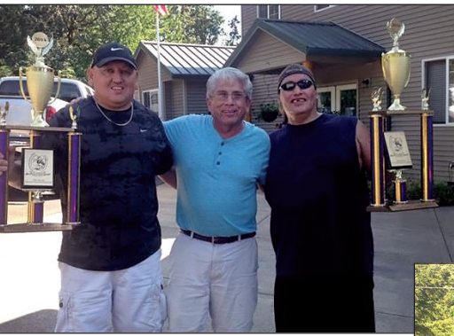
Winners of the 10th annual Monte "Mouse" George horse- shoe tournament