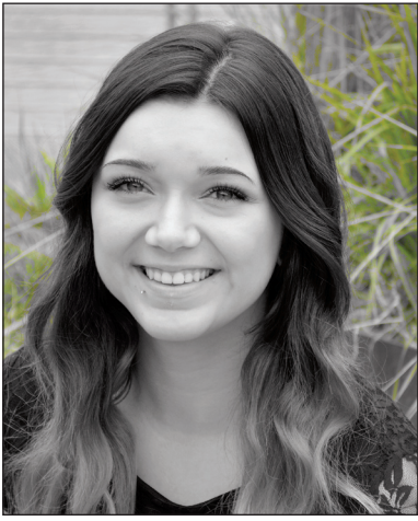
Happy 18th Birthday to my beautiful baby girl! I love you to the moon and back!

Celebrating 16 years of this beauty. Happy Birthday to my favorite daughter! Love, mom.