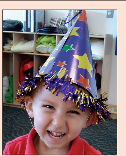
Happy 4th Birthday

During the Native American Journalist Association conference held July 11-13 in Santa Clara, Calif., Smoke Signals received 10 awards. ■