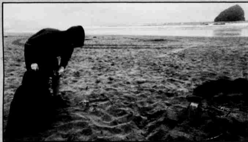
Tribal descendant A.J. Farmer picks up trash on the beach in Pacific City during Youth Education's beach cleanup day on Monday, April 30.