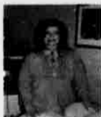
Happy Spirit Healing Arts

This class will help you develop the skills you need to start your journey into business ownership.