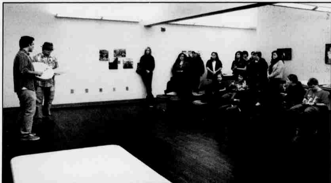
Tribal members Travis Mercier, left, and Brain Krehbiel sing a blessing song at the beginning of the Youth Education building open house on the Tribal campus on Thursday, Jan. 26. The more than 2,500-square-foot addition to the building includes a media center, sound room, culinary arts kitchen and cultural arts area.