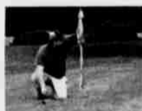
Omega Landscape Maintenance & Design