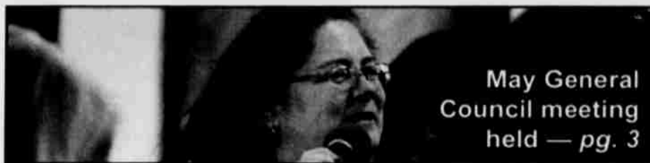
May General Council meeting held — pg. 3

S12 P4 OR NEWSPAPER PROJ. UO LIBRARY SYSTEM PRE 1299 UNIVERSITY OF OREGON EUGENE OR 97403-1205