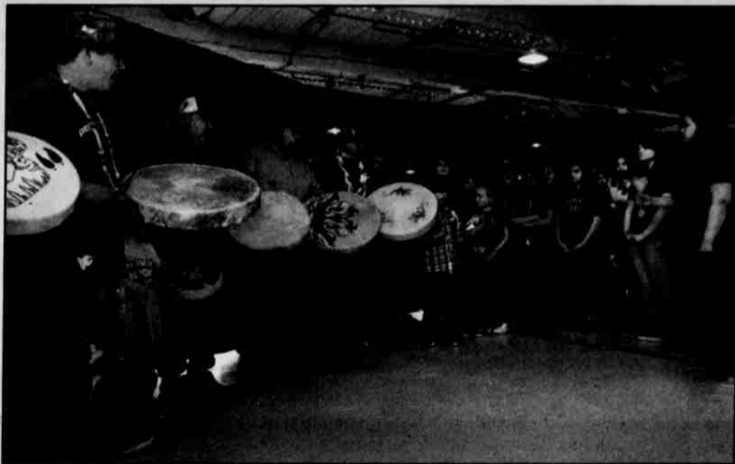
The Grand Ronde Canoe Family sings and drums at the opening reception for the "Grand Ronde's Canoe Journey" exhibit at the Willamette Heritage Center at the Mill in Salem on Thursday, April 7.