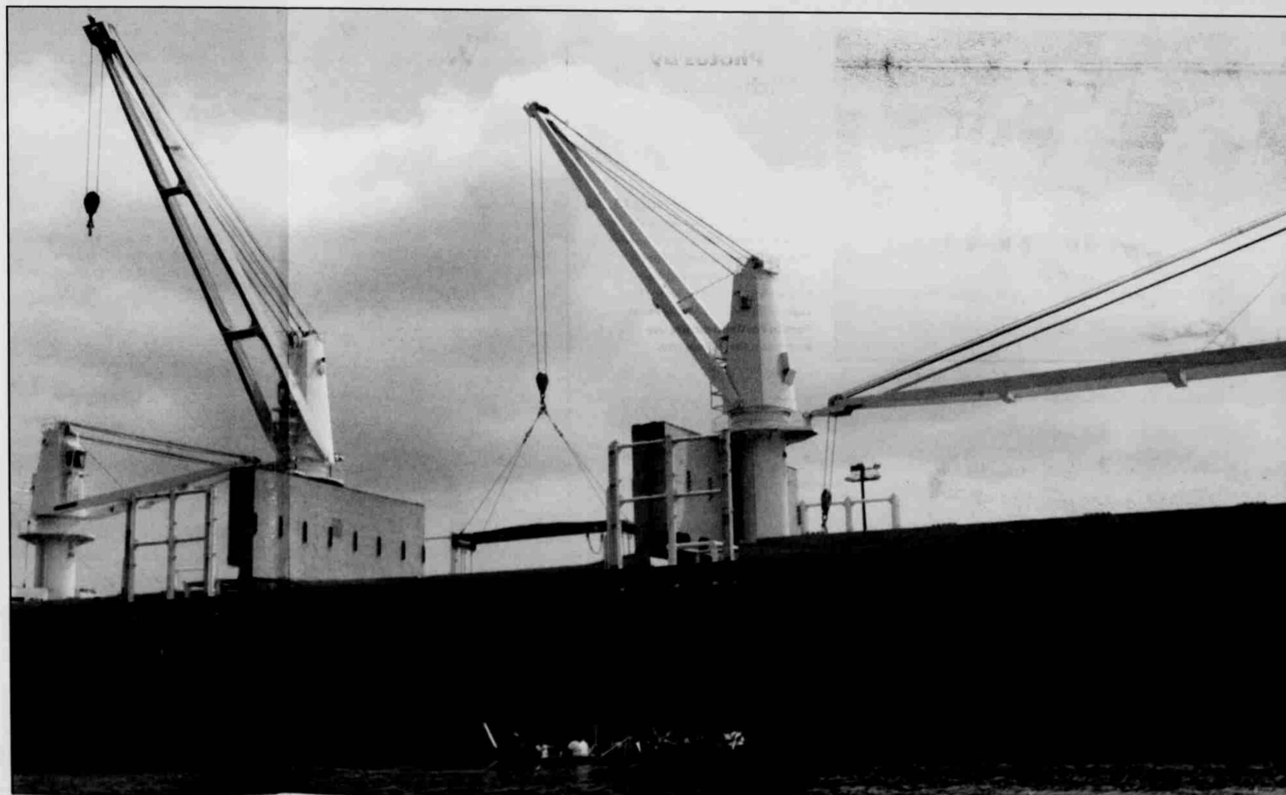
The Grand Ronde Canoe Family paddles past a cargo ship during the Paddle on the Willamette.