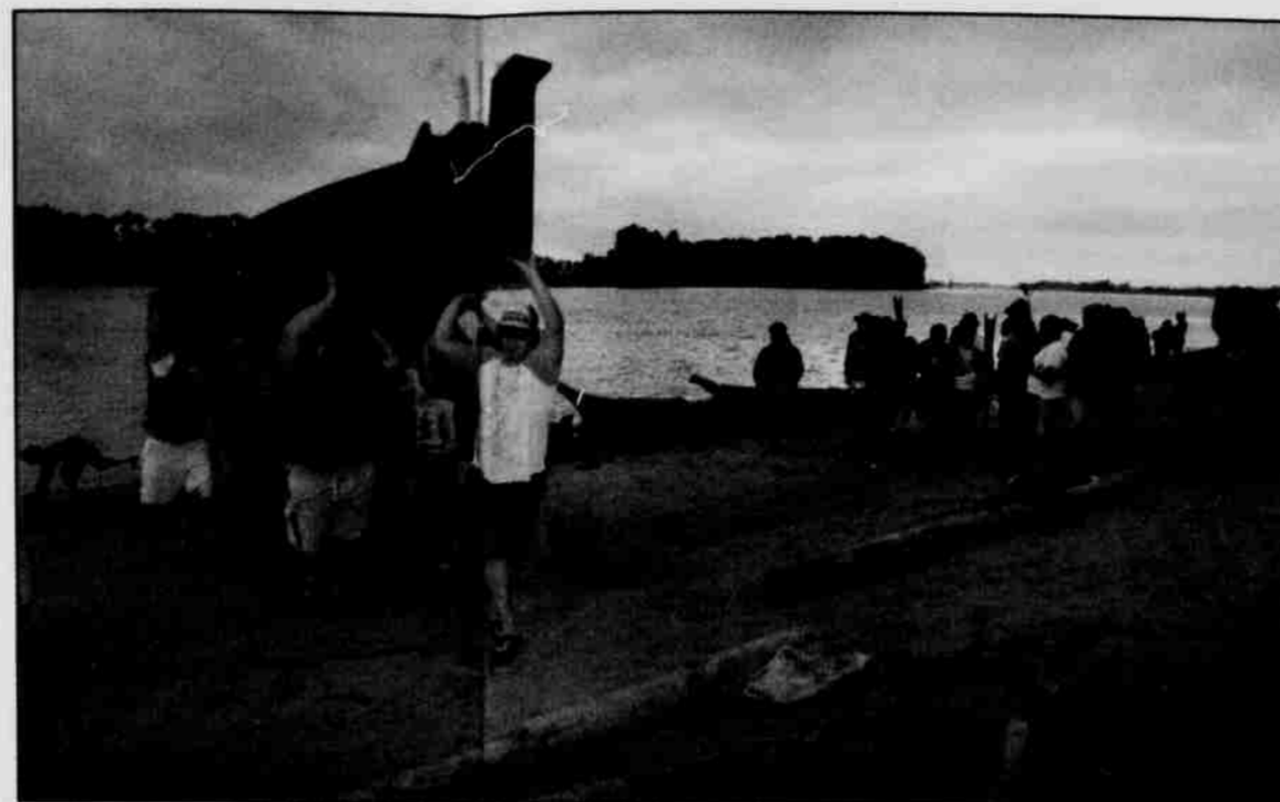
The Grand Ronde Canoe Family canoe is carried from the beach at Kelley Point Park in Portland to the trailer.