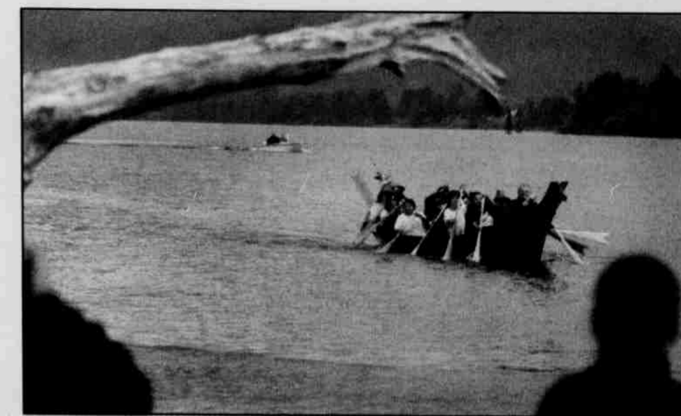
The Grand Ronde Canoe Family arrives at the beach at Kelley Point Park in Portland at the end of the Paddle on the Willamette.