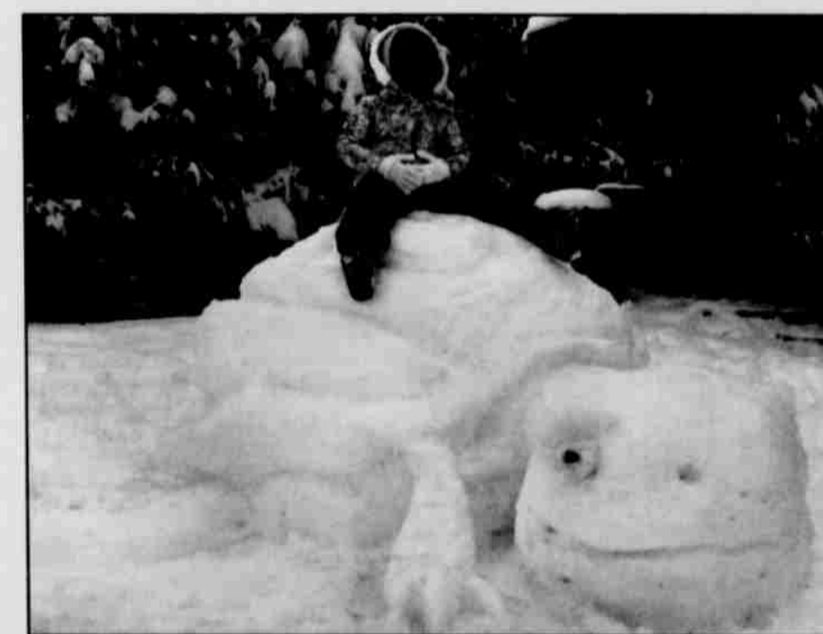
Although the snow storm caused problems for adults, it created play opportunities for local youth, such as Kayla Valdez, 4, who sits atop a snow turtle built in her front yard on Saturday, Dec. 20.