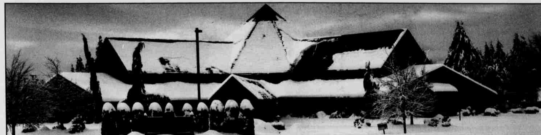
The Grand Ronde Health & Wellness Center is blanketed with snow.

of Dec. 15-19, giving students a three-week Christmas break.