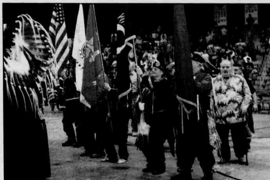
Members of the Honor Guard participate in the Grand Entry of Willamette University's sixth annual Social Powwow at the Salem university on March 8.