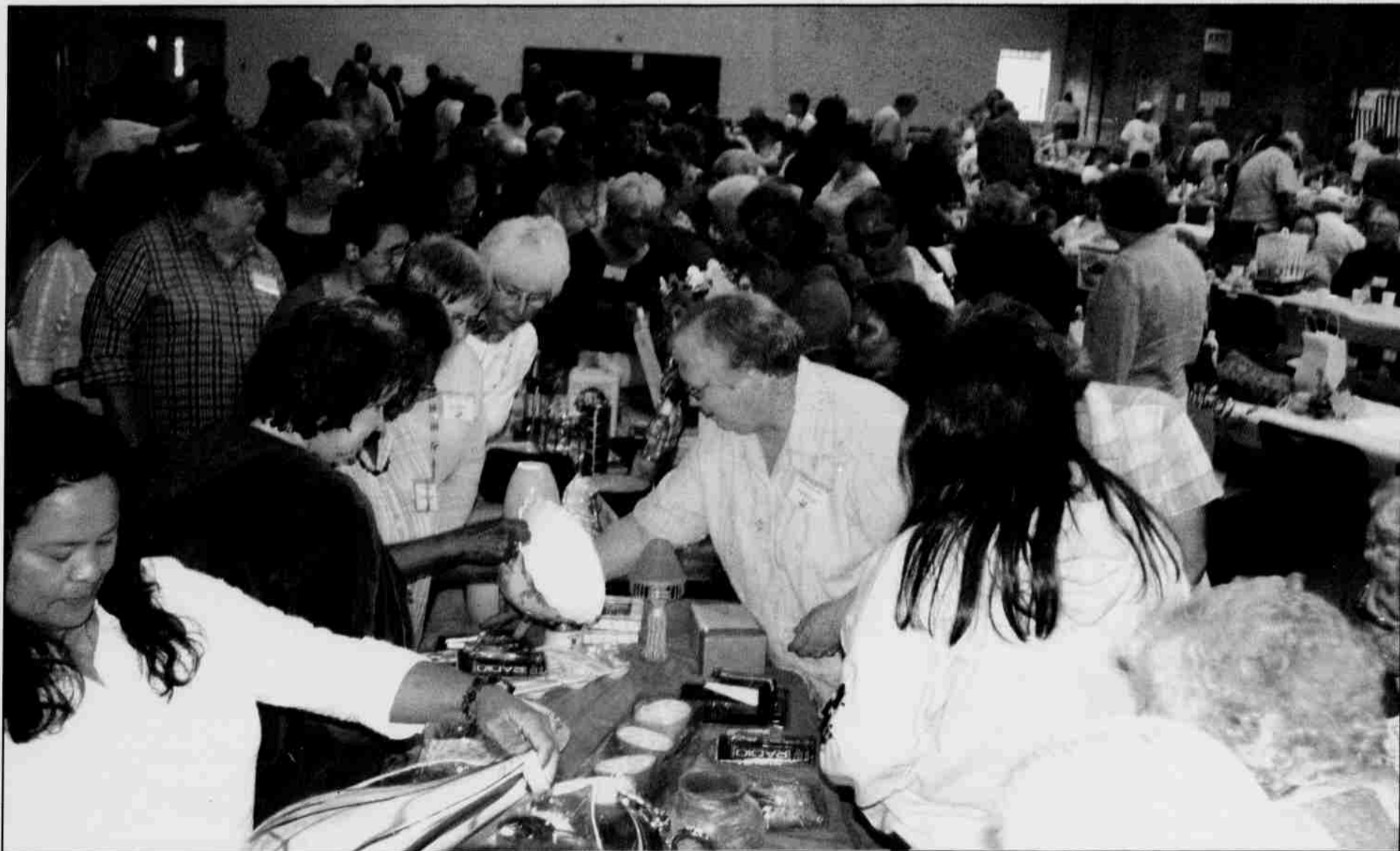
Tribal Elders pick out gifts at the 2007 Elders Honor Day held at the Tribal gymnasium on July 20-21.