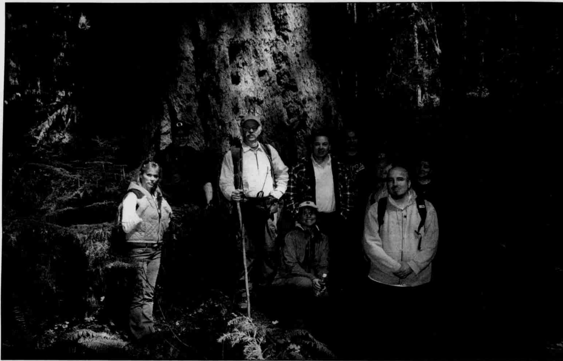
A group of Tribal members and Tribal Council members pose with a group of Willamette National Forest employees in front of an old-growth tree during the two-mile hike from Cascadia State Park to Cascadia Cave. A Tribal delegation went to Cascadia Cave to bless the area and share ideas about how to preserve the 8,000-year-old petroglyphs.