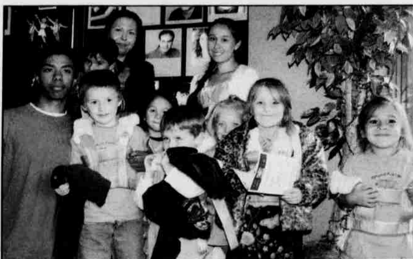
Harnessed Up — Preschool and HeadStart students enjoy Izzy's pizza during a field trip to see "Cinderella" at the Broadway Rose Theatre Company in Portland on Wednesday, July 12.