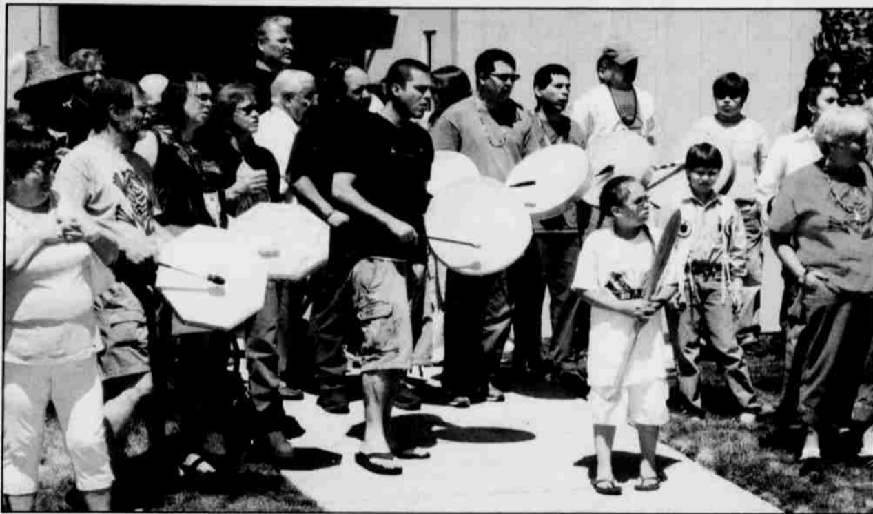
Honor Song — Members of the Grand Ronde Canoe Family (left) along with Chinook Canoe Family members sing an honor song as the community is first introduced to "Stankiya", Grand Ronde's handmade canoe, which means "change" in Chinook Wawa.