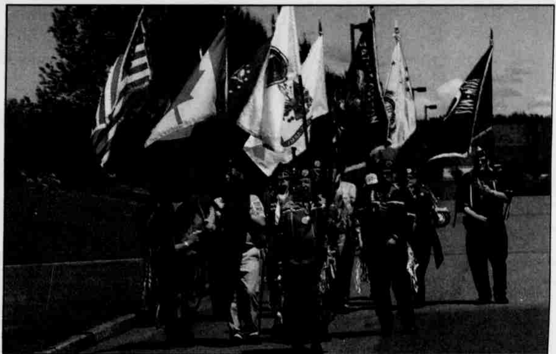
Above, the Honor Guard march in to post the colors. Below, the Eagle Staff in front of the Veterans' Memorial.