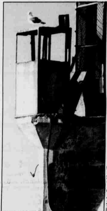
Guard Tower on Alcatraz

All three proposals were acknowledged and adopted by the state.