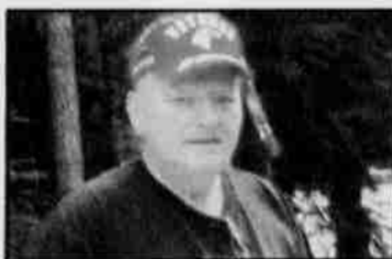
Happy Birthday December 4 Remember, happy thoughts today, I love you dear. Bobbie