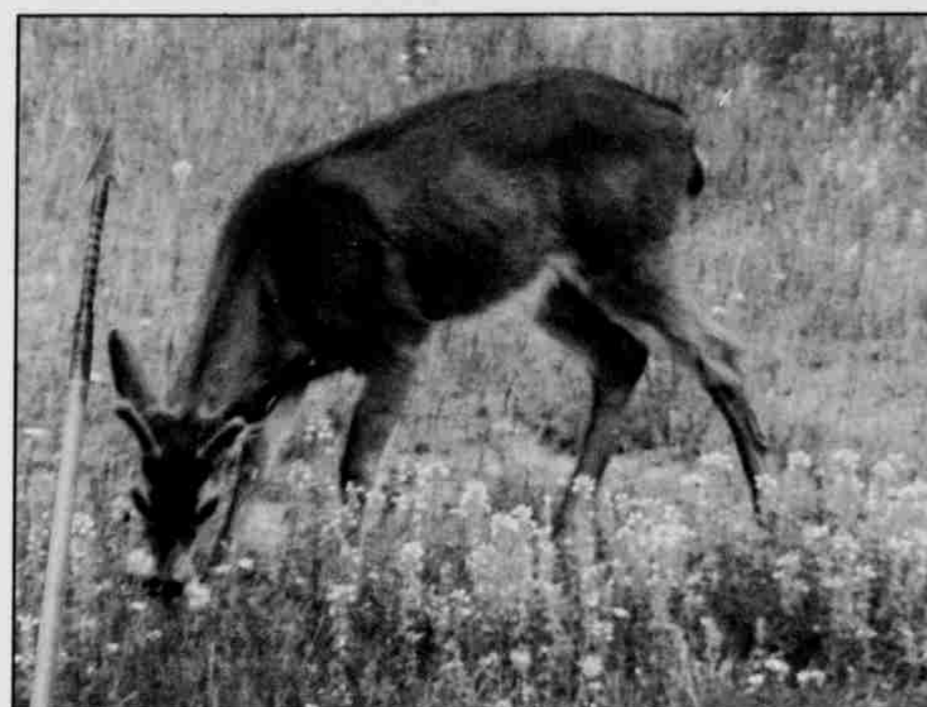
A deer grazes in the grass outside the Tribe's Governance Center.