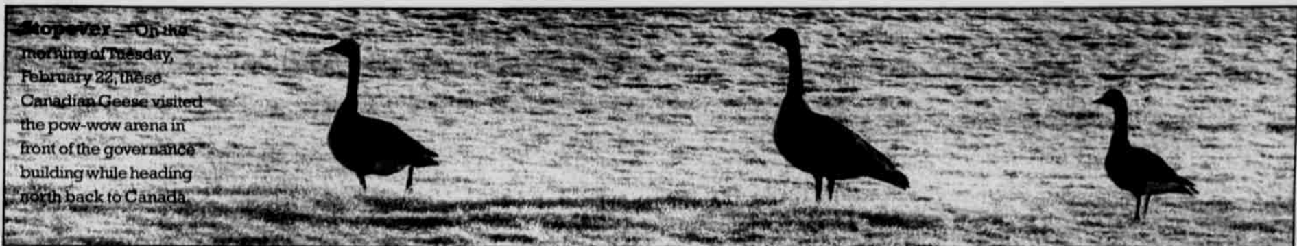
Stopover — On the morning of Tuesday, February 22, these Canadian Geese visited the pow-wow arena in front of the governance building while heading north back to Canada.