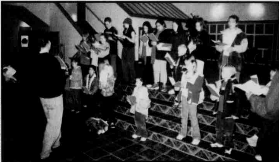
Christmas Caroling — Before & After students visited the Tribal offices signing Christmas Carols. Caroling has become a yearly tradition for local students.