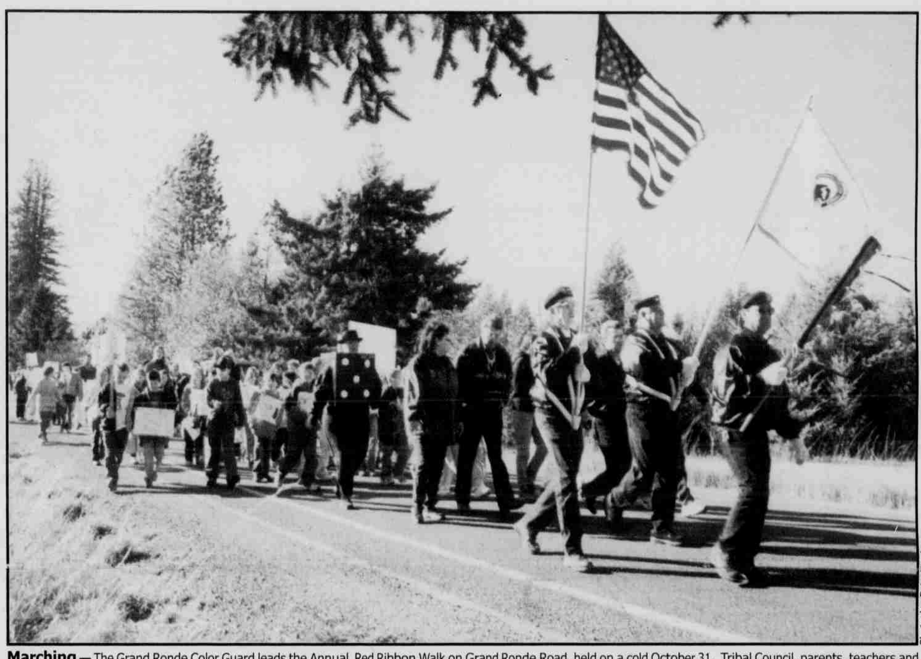
Marching — The Grand Ronde Color Guard leads the Annual Red Ribbon Walk on Grand Ronde Road, held on a cold October 31. Tribal Council, parents, teachers and (More photos on page 7) students from Grand Ronde Elementary School marched from the Grand Ronde Elementary School to the Tribe's Governance Center.