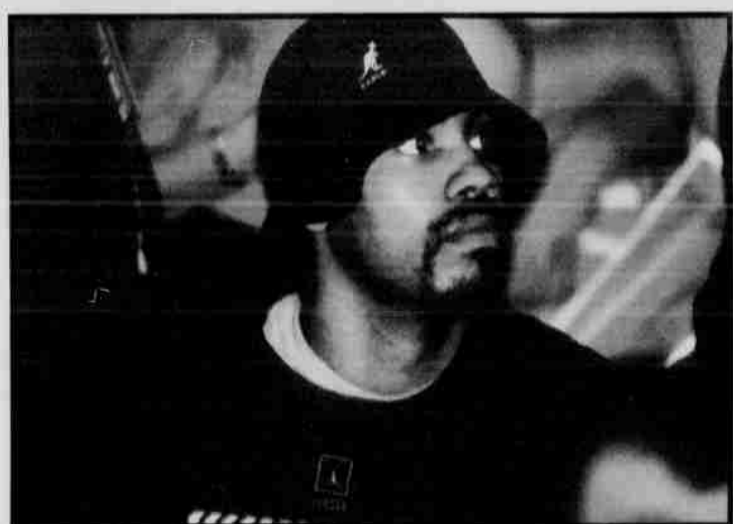
Star — Portland Blazer's All-Star Power Forward Rasheed Wallace attended the fights. No technical fouls were called on Wallace who sat peacefully in the audience with his family.