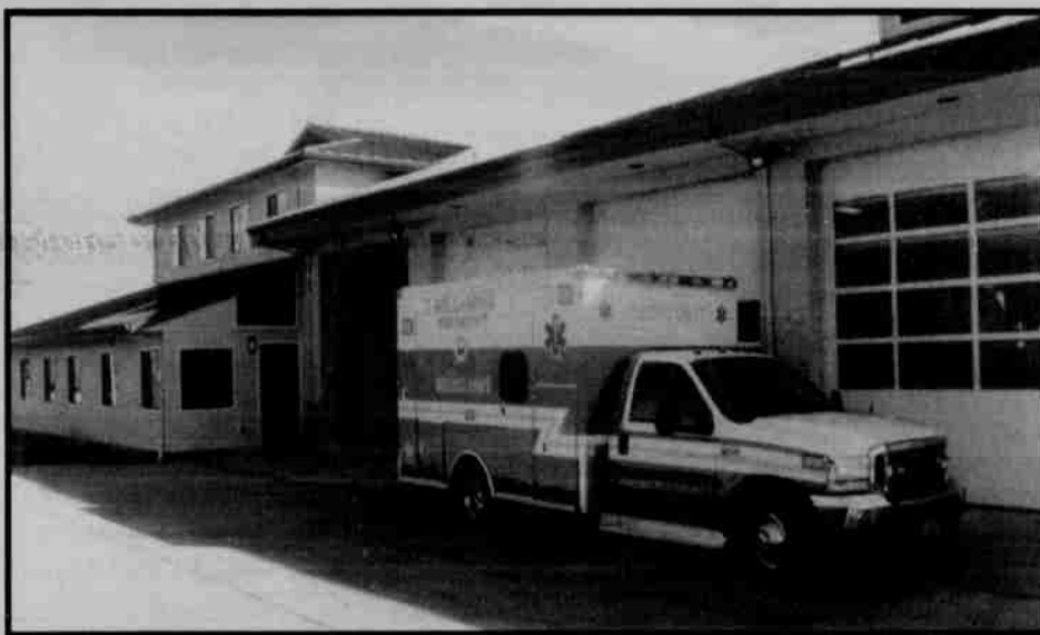
The new ambulance pictured in front of the new Willamina Fire Hall, located at 825 N.E. Main Street.

The new ambulance will help the fire department respond to an increase in medical calls, including Spirit Mountain Casino which draws 3 million visitors a year. Increased tourism throughout the region, especially