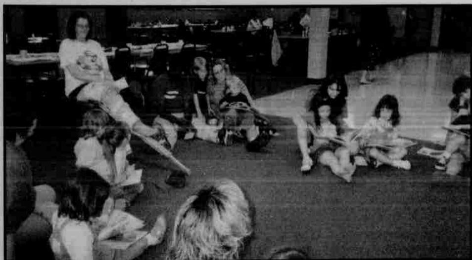
HEAD START LITERACY NIGHT: Twah Sunchako Head Start held its first literacy night where Head Start children and parents joined together for a meal and read a book together. The literacy nights will be a monthly

sharing of books at home. Parents and teachers have a common goal of keeping children safe and healthy while also wanting them to learn whatever they need to succeed. And one of the skills needed to succeed is definitely learning to read. And while that is not developmentally appropriate for preschool aged children, it is very appropriate for them to gain love of reading and books at this age. Hopefully, literacy night will become one more reason for our Head Start children to really enjoy literacy.