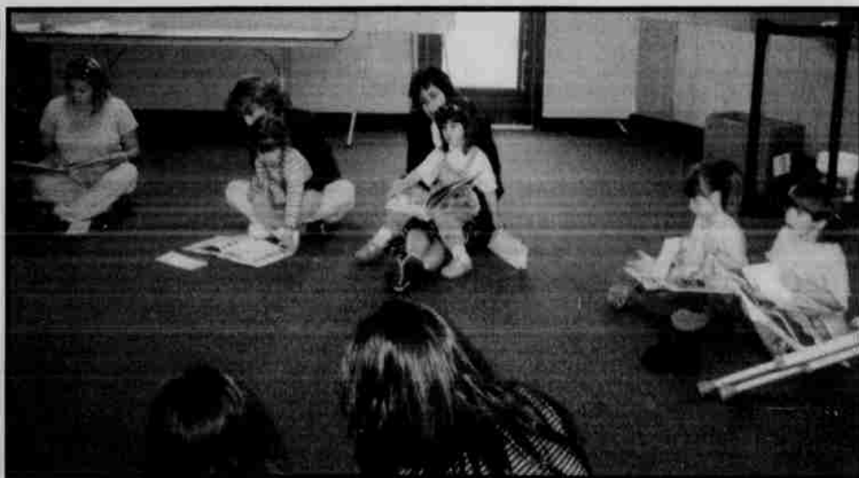
event starting with the new school year. Shown here are students with their parents in "circle" where a book is read to them. The next literacy night will be held on July 26.