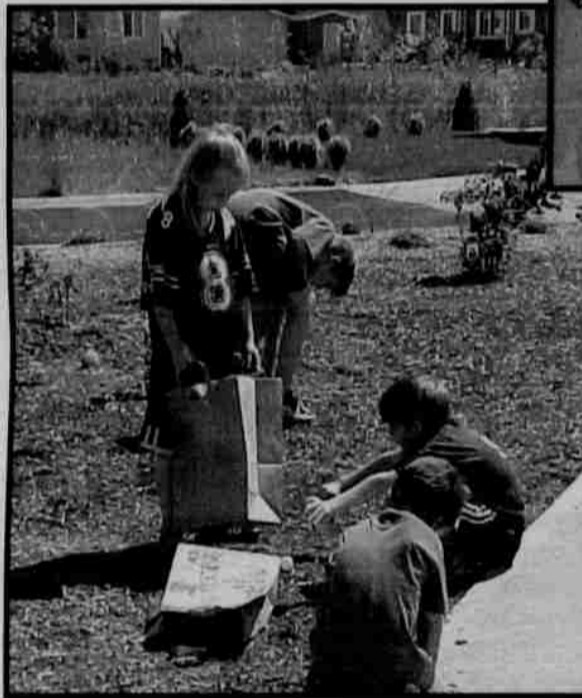
Left: Youth took part in the Elder's spring cleanup day as a way to show their respect.