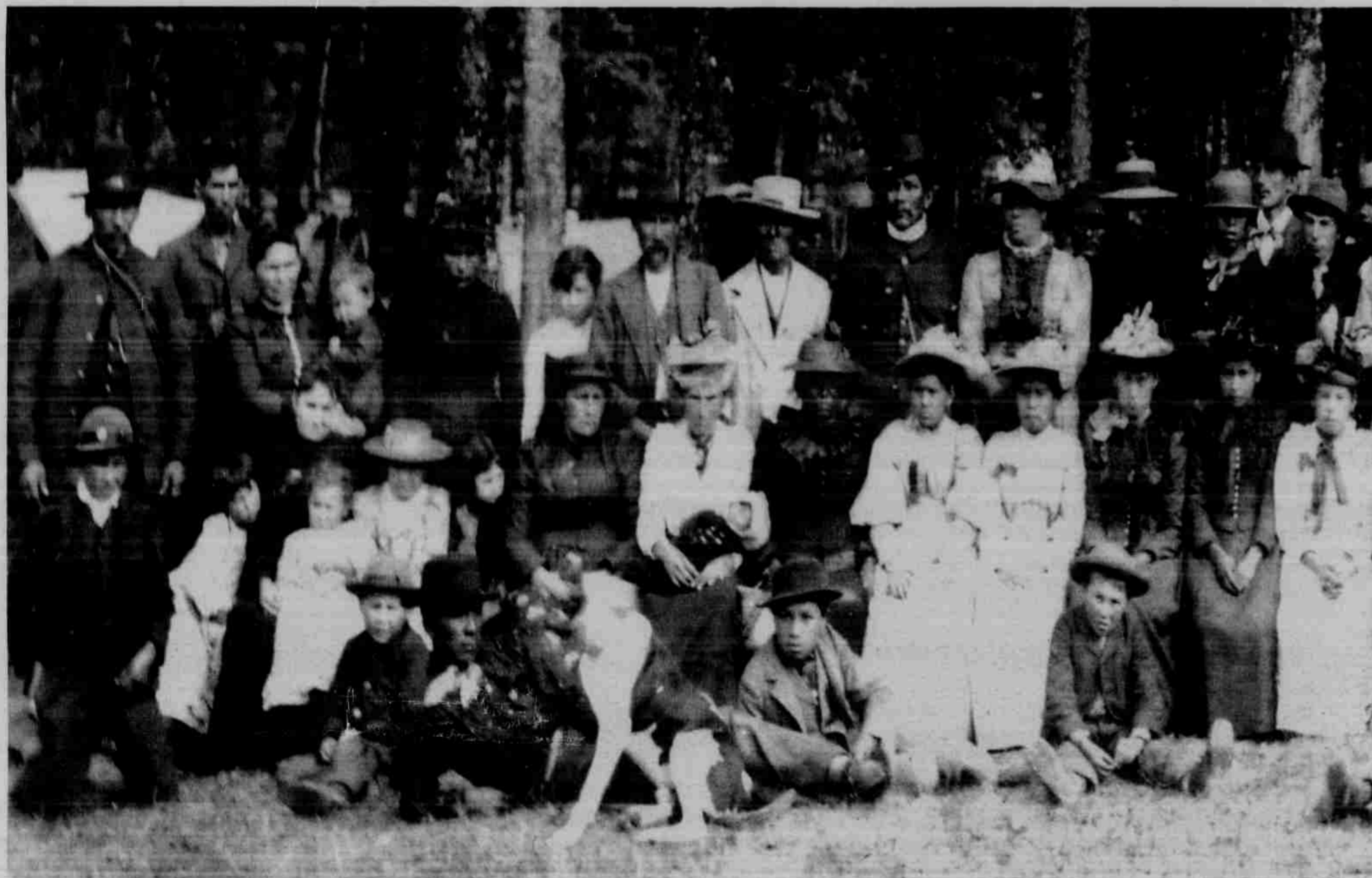
GRAND RONDE GATHERING, around 1890

The family is inviting everyone to attend. No gifts please.