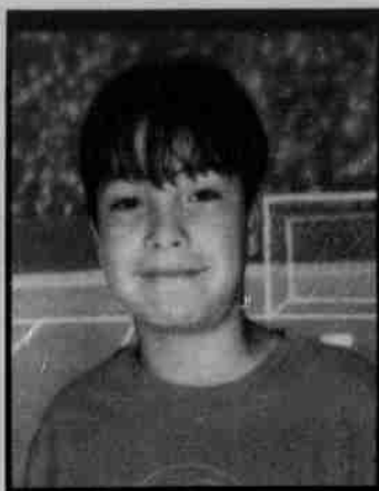
HIGH PINE EASTMAN