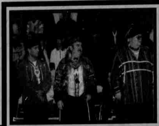
Tribal veterans help Chemawa celebrate its 118th birthday during a special pow-wow on February 21.