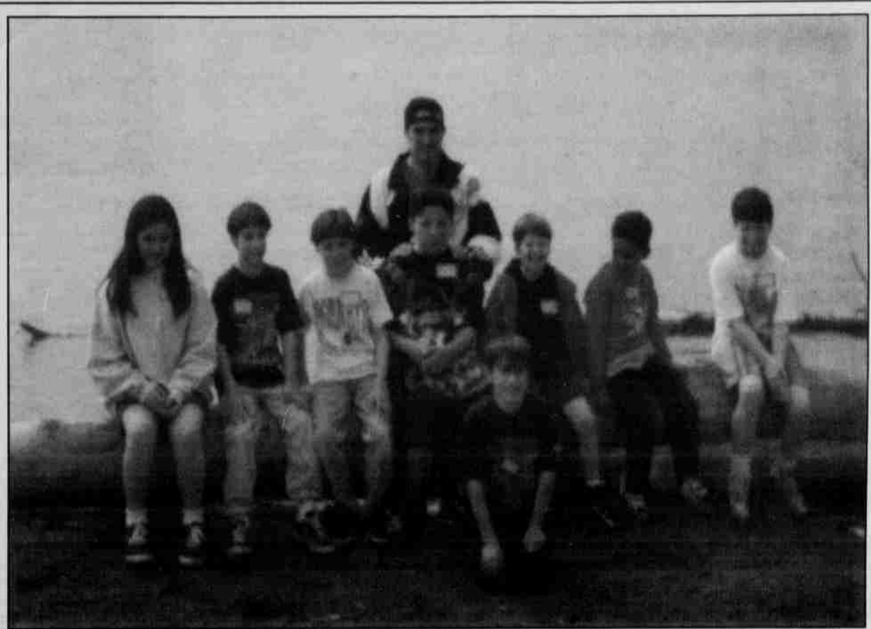
AT THE RIVER: The After School Club visited the Vancouver Water Resource Center on April 25 and learned about water distribution and protection. They also visited some nature trails on the Columbia River.