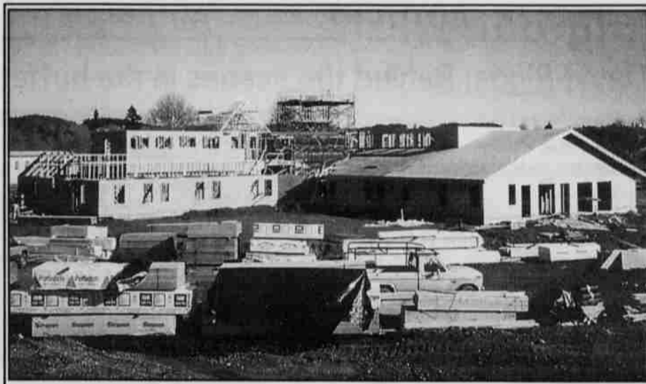
Construction is moving so fast on the Health Clinic — here you can really begin to see how the building is going to look when it's done.