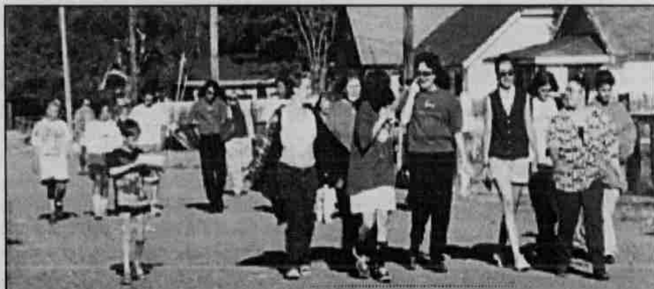
A community march was held in July in Bunnsville, a residential area of Grand Ronde. About two dozen marched in protest of drugs, violence, and crime in their neighborhood.

You are invited to celebrate the beginning of the Confederated Tribes of Grand Ronde Health and Wellness Center. A ground-breaking ceremony for the construction of the clinic facility will be held on August 16, 1996 at 10 a.m. Grand Ronde Road