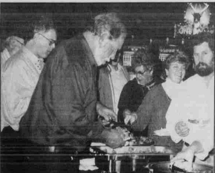
The chefs at the casino provided visitors with first-rate appetizers.