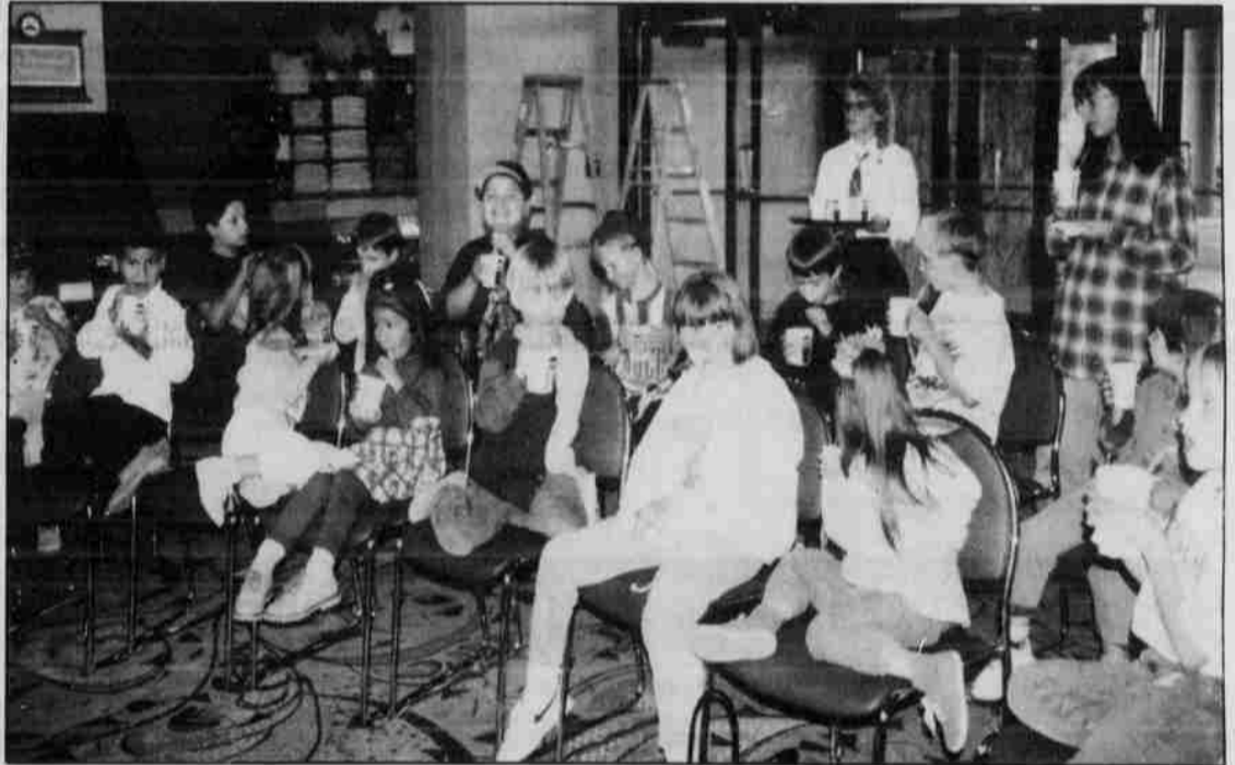
Children were allowed to visit the casino on Monday the 16th. Pictured above is the tribal After School Club, they were given drinks and had a lot of fun on their tour.