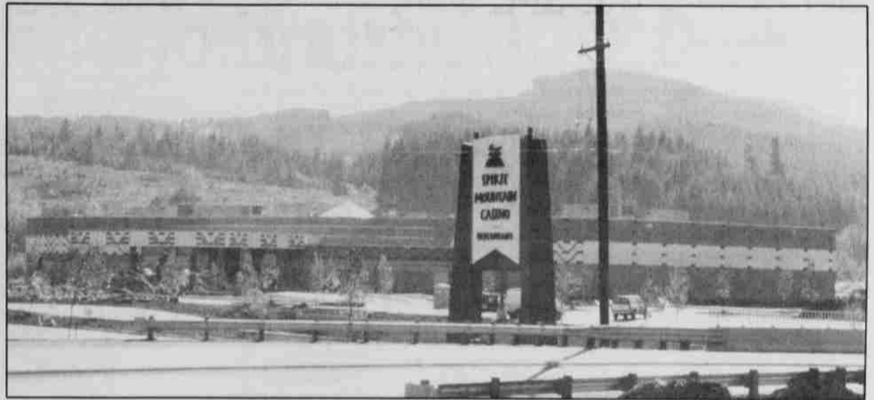
The new outdoor sign made the casino complete for opening night.