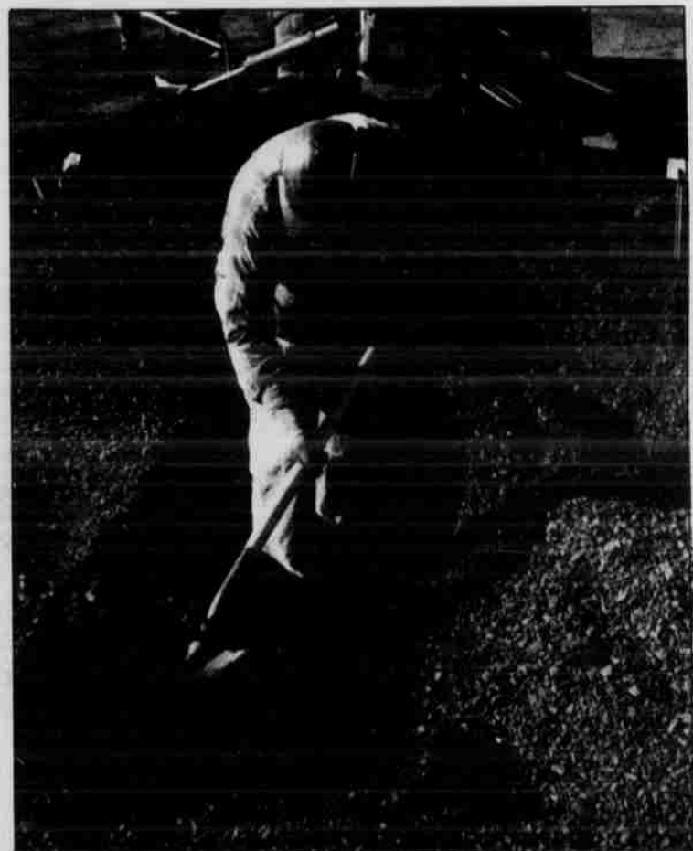
Some of the work still needs to be done by hand.