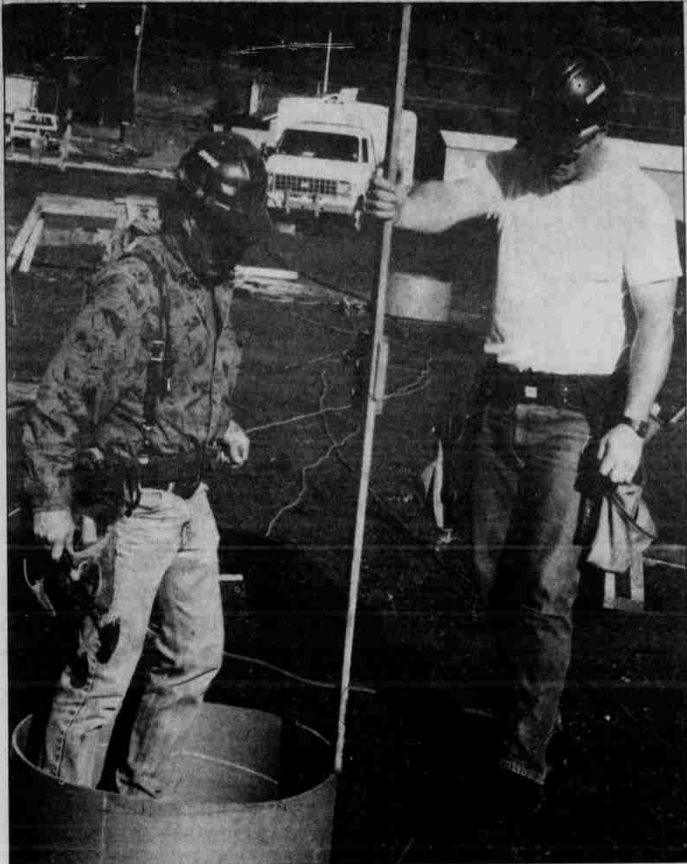
Two carpenters preparing forms.