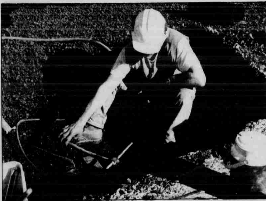
Pressure testing lines in the foundation.