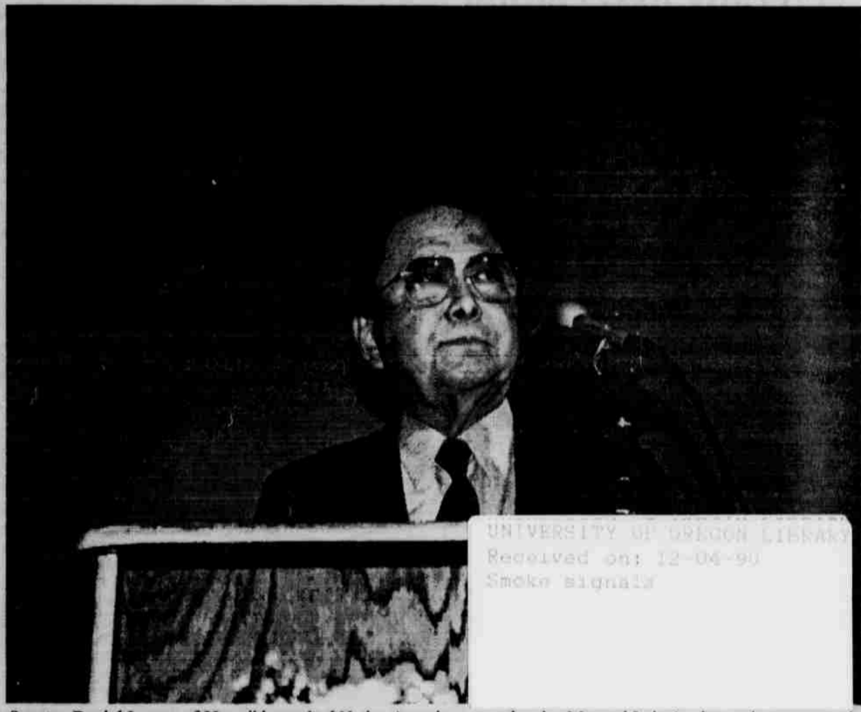
Senator Daniel Inouye of Hawaii has asked Native Americans to take give Manuel Lujan's plan a chance to work.

General Council Meeting December 2nd, 1990 Meeting at 11:30 a.m. Meal following the meeting