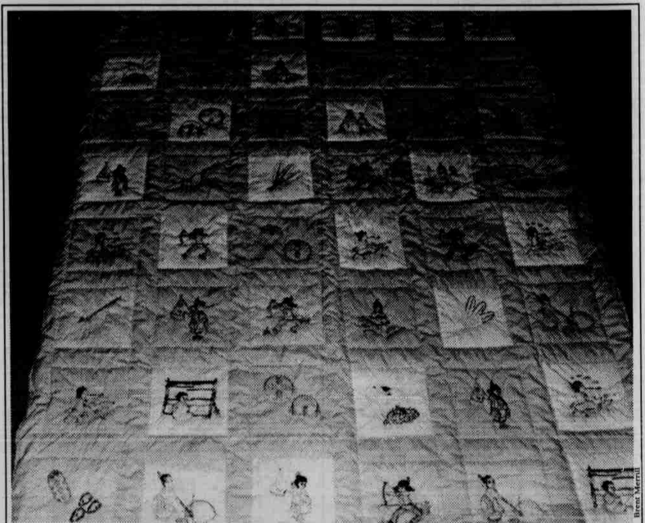
This beautiful quilt was hand made by the Grand Ronde elders during their twice weekly craft classes at the depot.