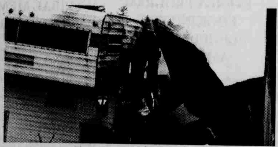
The Smith's camper was destroyed in the fire.