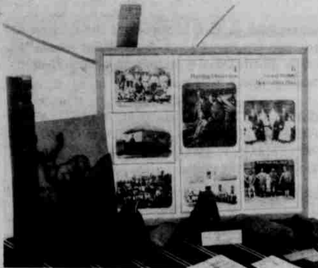
Grand Ronde history on display at Oregon State Fair.