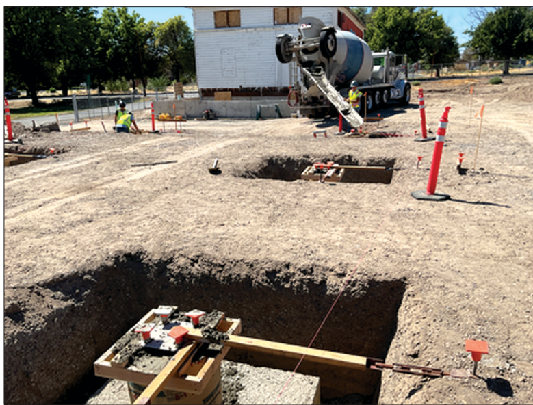
Construction workers on site at the food court area.

Earlier this year, WSCAT received a commitment of close to $4 million from the state of Oregon for the work, a significant boost toward making the idea happen.