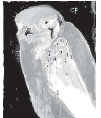
Painting by the artist.