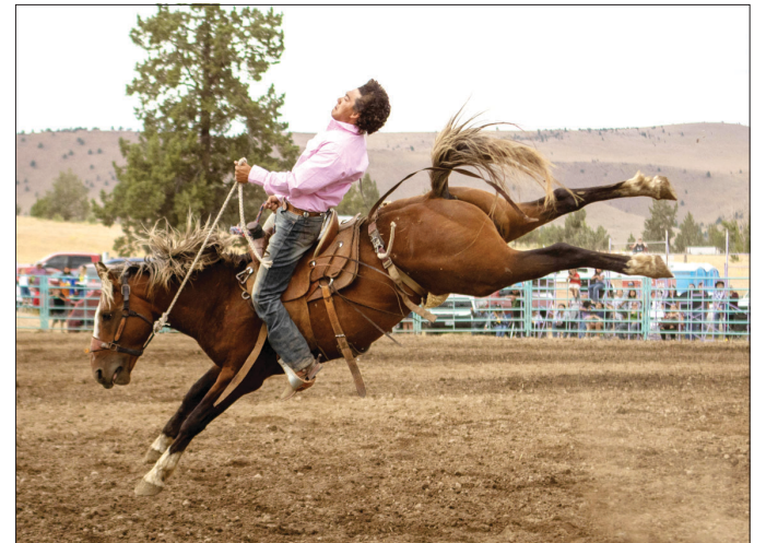
Pi-Ume-Sha Grand Entry, Saturday, June 29, 2024; and Pi-Ume-Sha Rodeo action.