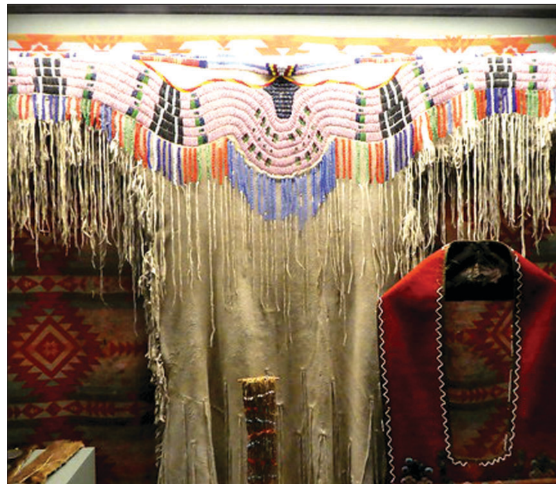
Wasco beaded dress, part of museum display.