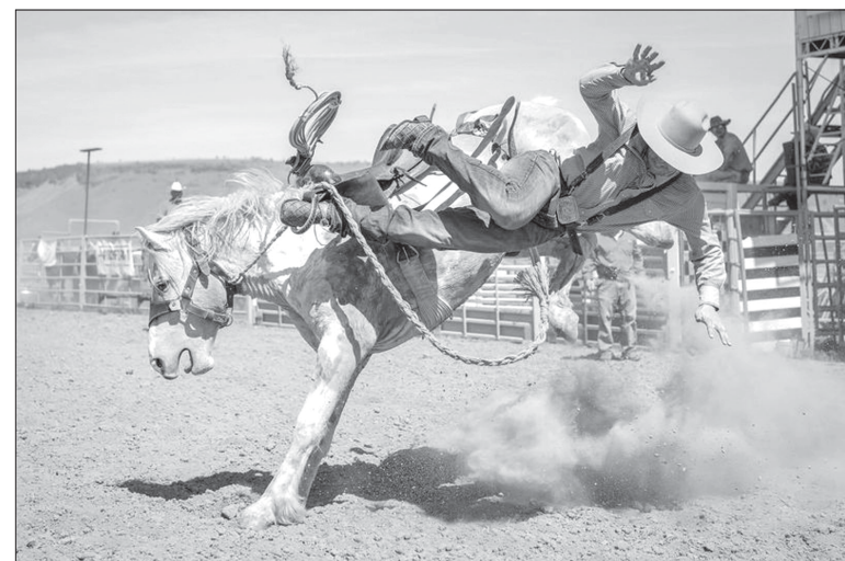
Spring Root Feast Rodeo, hosted by the Ranch Rodeo Association.