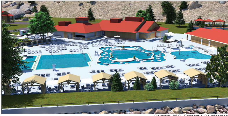
East view of the Kah-Nee-Ta Resort pool area.