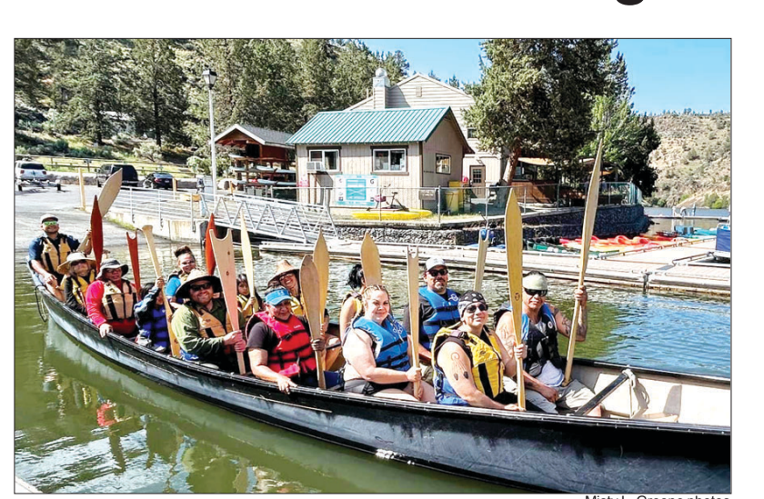
A recent Canoe Family outting on Lake Simtustus, getting ready for the Journey to Muckleshoot.

The Canoe Families travel by waterways to the destination, accompanied by family