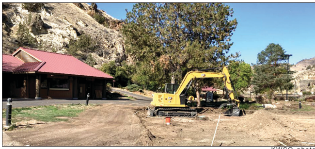
March construction work at Kah-Nee-Ta Resort & Spa.