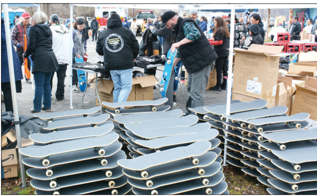
PacificSource provided more than 150 skateboards for a giveaway to local youth.