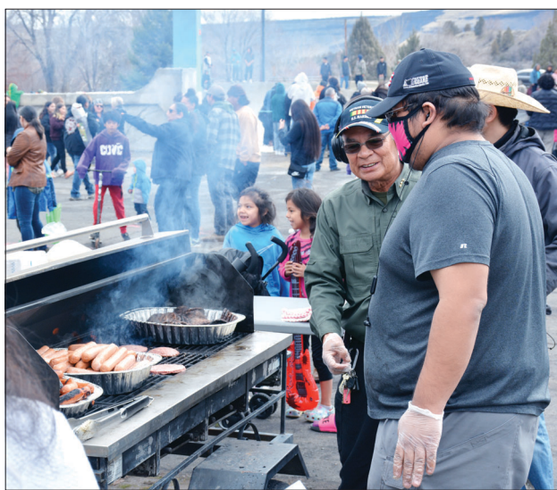
Emergency Management at the grill.