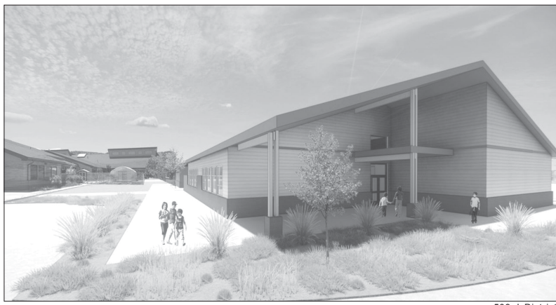
Architect's rendering of new Academy classrooms.